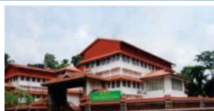
P.N.N.M Ayurveda Medical College, Shoranur