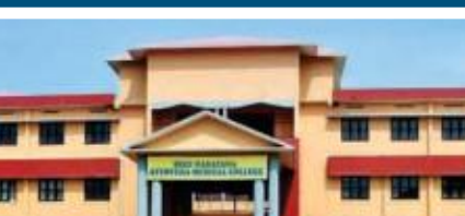
Sree Narayana Institute of Ayurvedic Studies & Research, Puthur, Kollam