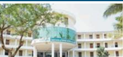
Santhigiri Ayurveda Medical College, Palakkad