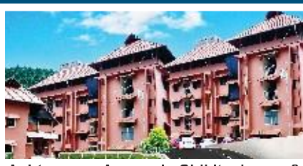
Ashtamgam Ayurveda Chikitsalayam & Vidyapeedham (AACV), Vavanoor