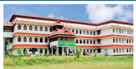
Nangelil Ayurveda Medical College, Kothamangalam