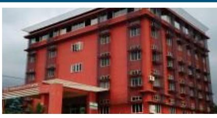
Markaz Unani Medical College & Hospital, Kozhikode