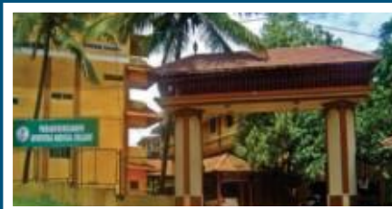
MVR Ayurveda Medical College Parassinikadavu, Kannur