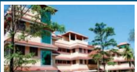
Mannam Ayurveda Co-operative Medical College, Pandalam