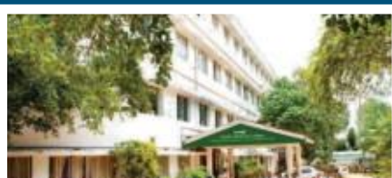
Santhigiri Siddha Medical College, Thiruvananthapuram