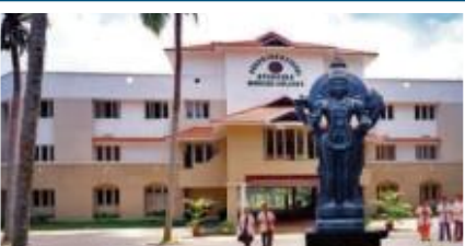
Pankajakasthuri Medical College, Thiruvananthapuram