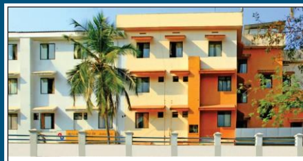
KMCT Ayurveda Medical College, Calicut